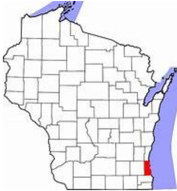
Milwaukee County Major city: Milwaukee