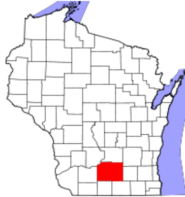
Dane County* Major city: Madison